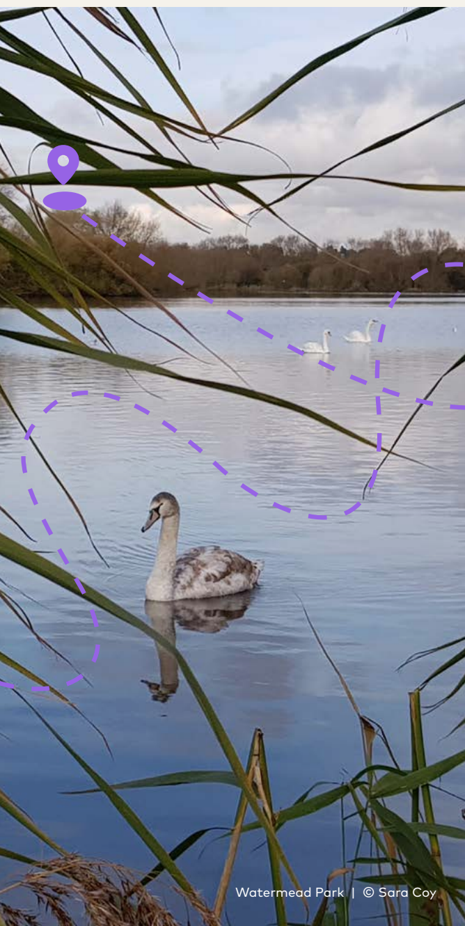
Watermead Park